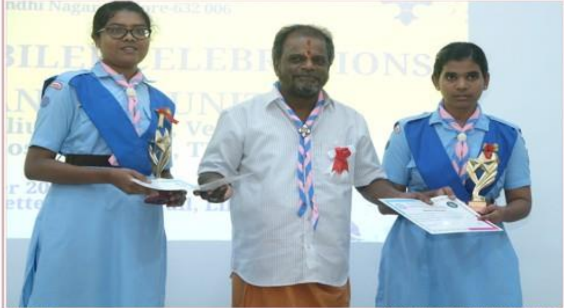
Silver Jubilee Celebrations of Rangers Unit -06.12.2025

jakbegs.photo@gmail.com - 9949 17367, (90775 11697 - GPe)