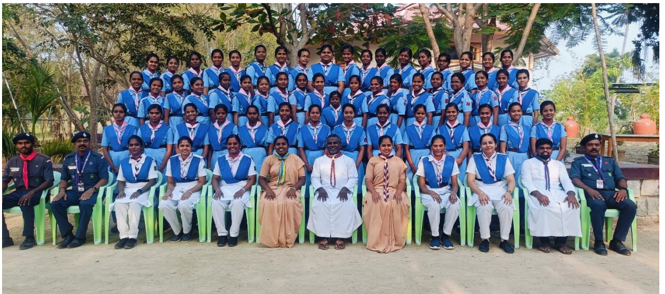
Rangers Moot Don Bosco Youth Village, Keeranur, Trichy 13 to 15, February 2026