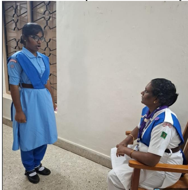
Pravesh Test – 14.10.2025