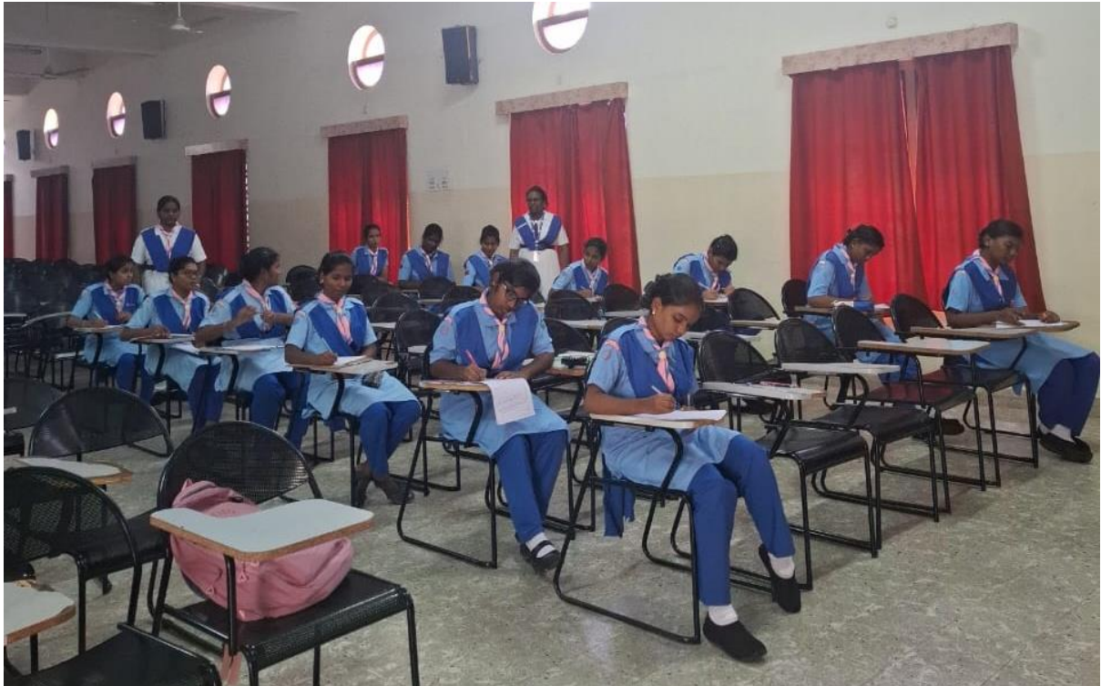
Silver Jubilee Competitions – Essay Writing on Cultural heritage of India 18.11.2025