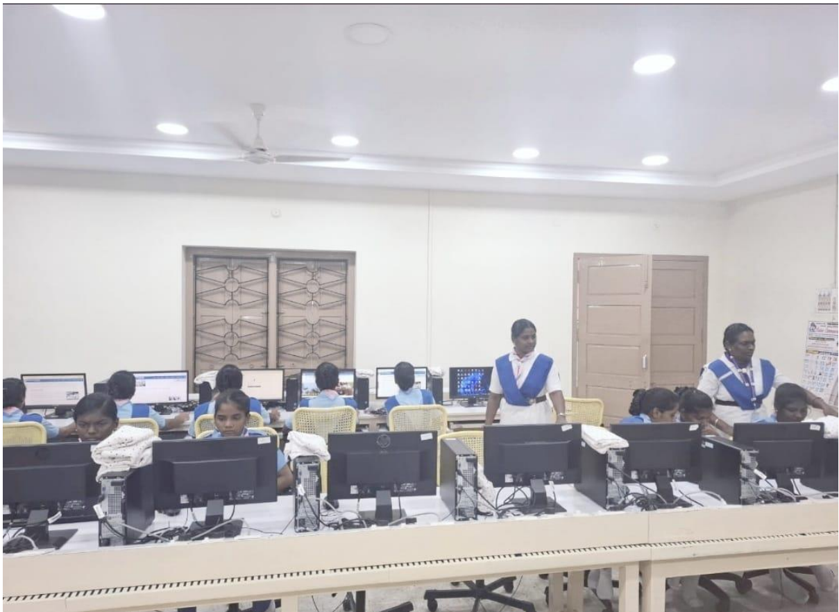
Silver Jubilee Competitions – Quiz on the History of the Scouting Movement 26.11.2025