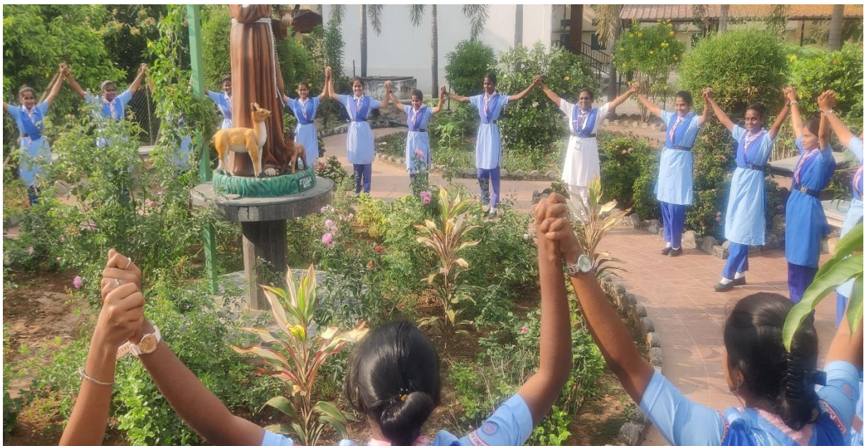
Celebration of 100 Years of World Thinking Day Joining Hands to celebrate the Theme "Our Friendship" 21.02.2026