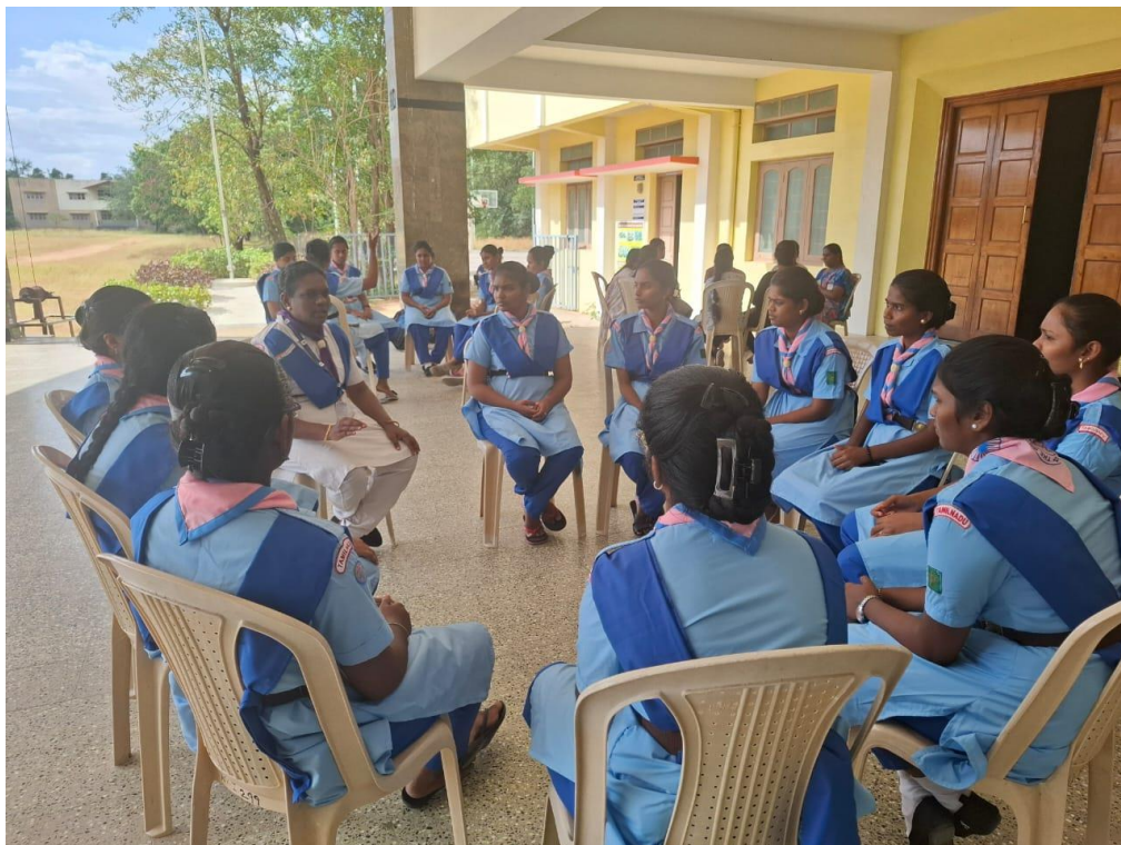
A Group Discussion on the themes of Gender Equality, Family Planning, and Sustainable Living on 15th July 2025, to commemorate World Population Day