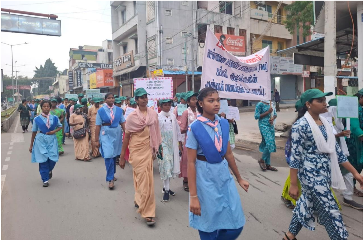
WALKATHON - Ecological Care – Promoting a greener, healthier, and more sustainable world – 29.11.2025