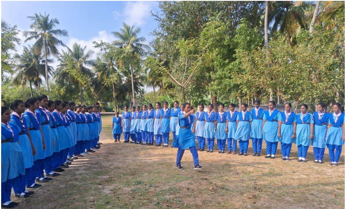
Rangers Moot Don Bosco Youth Village, Keeranur, Trichy 13 to 15, February 2026