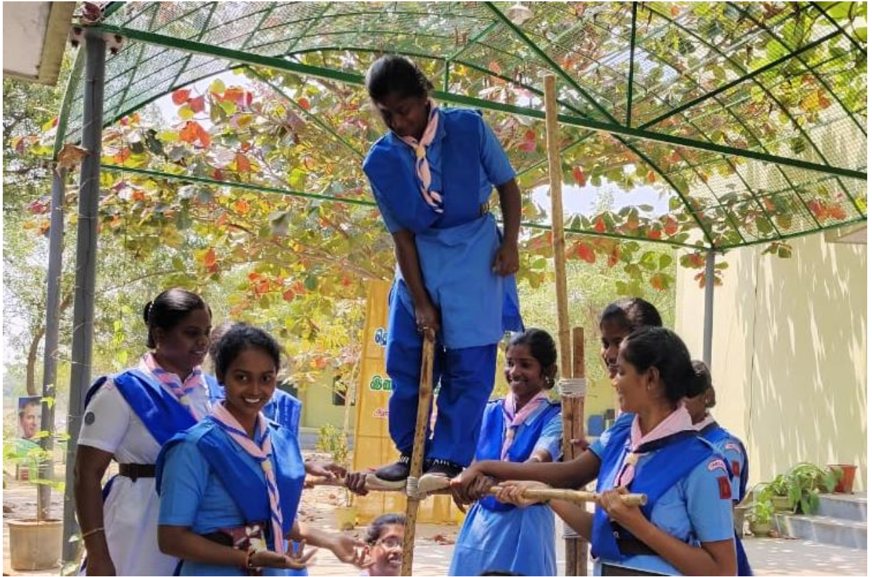
Rangers Moot Don Bosco Youth Village, Keeranur, Trichy 13 to 15, February 2026