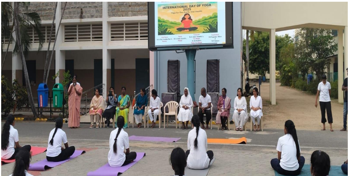
21.06.2025 - International Yoga Day