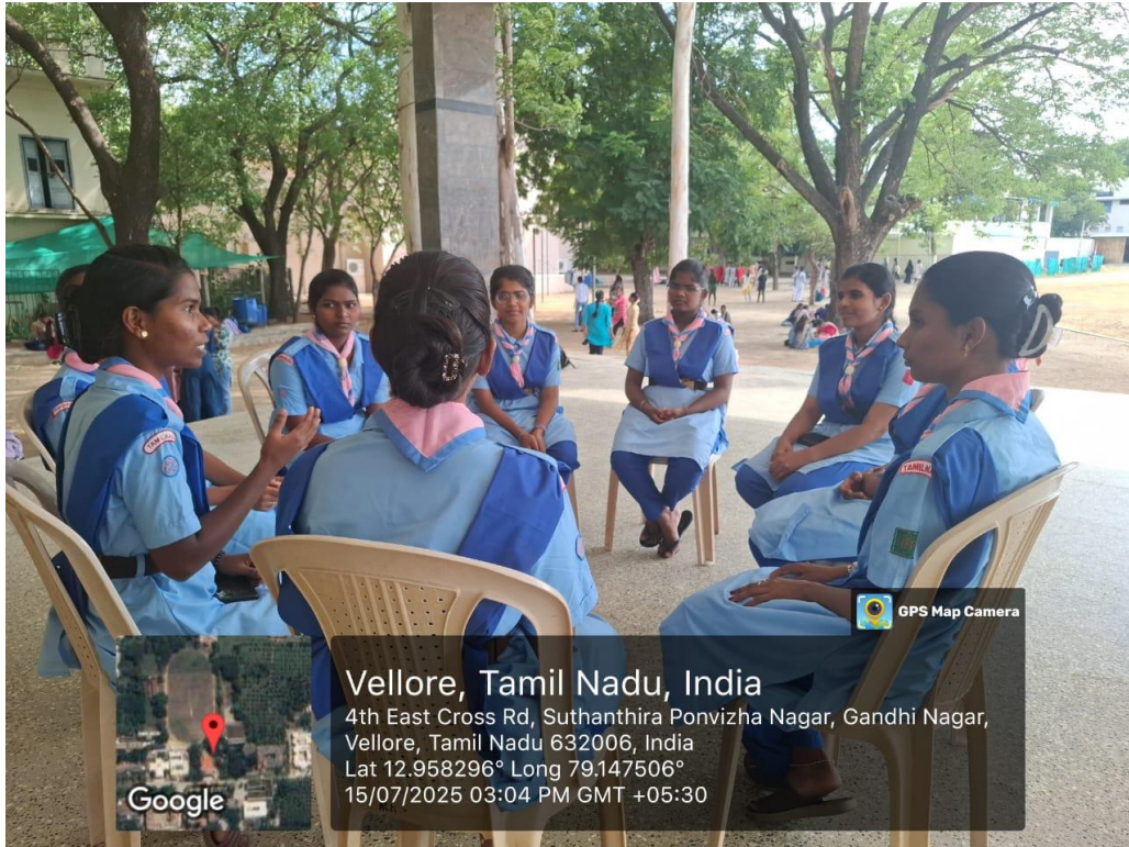
A Group Discussion on the themes of Gender Equality, Family Planning, and Sustainable Living on 15th July 2025, to commemorate World Population Day