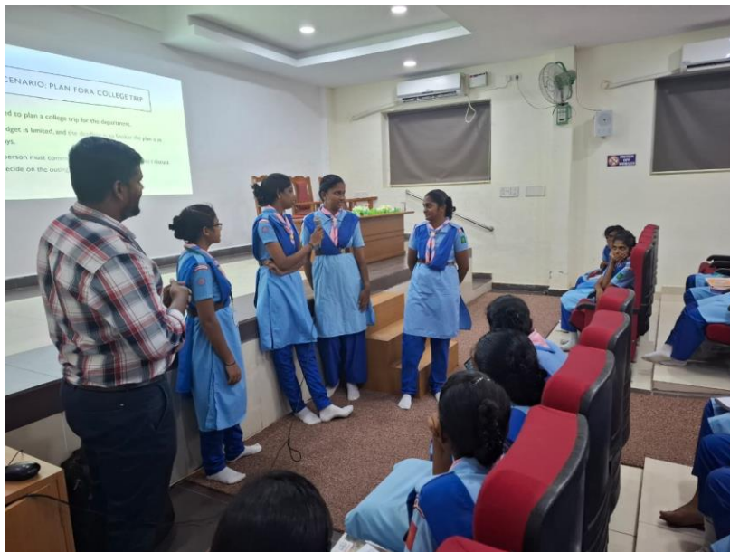
13.10.2025 – Workshop on Transactional Analysis