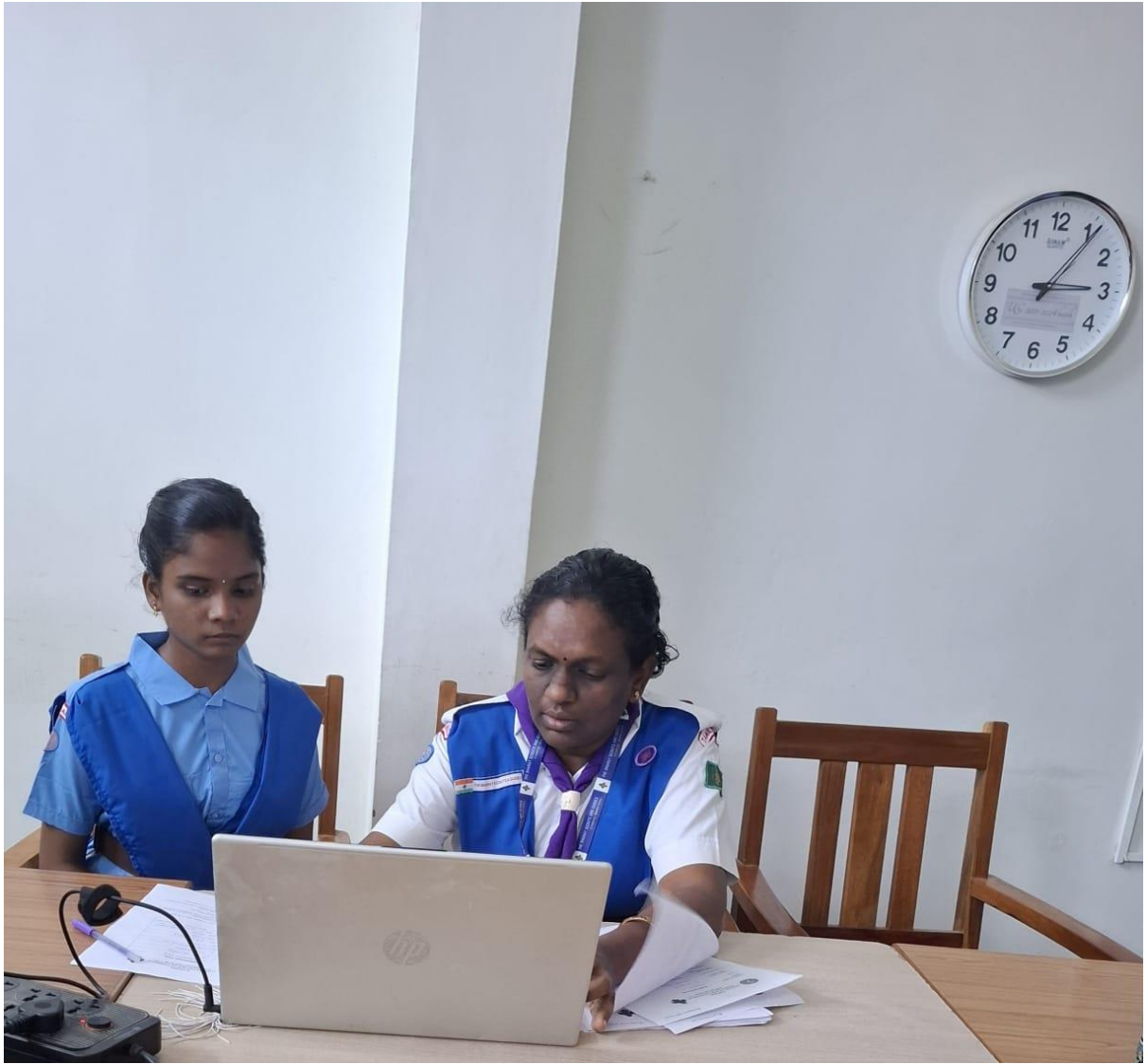
UID Creation of Rangers – 14.10.2025