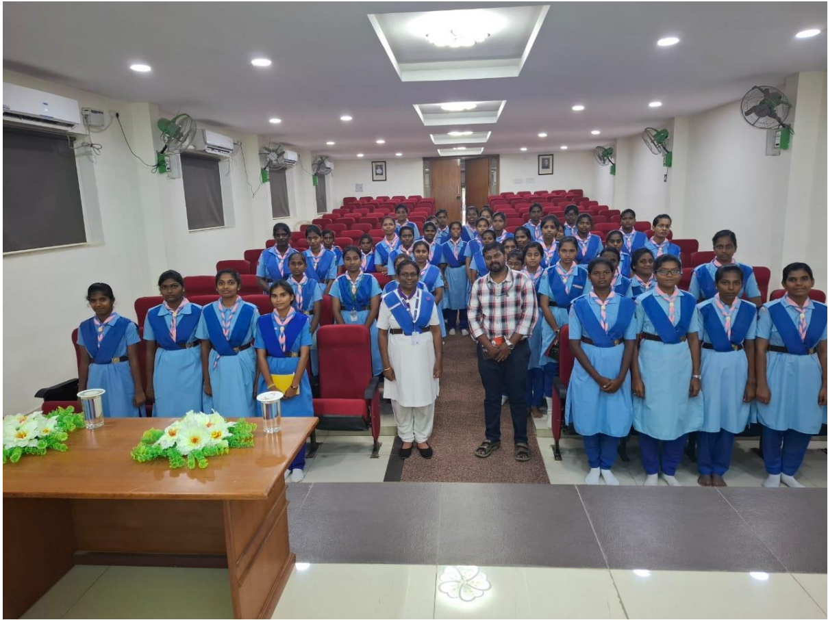
13.10.2025 – Workshop on Transactional Analysis