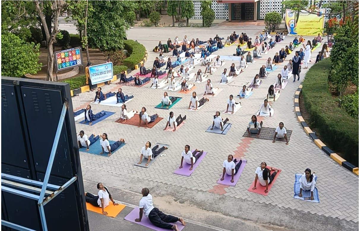
21.06.2025 - International Yoga Day