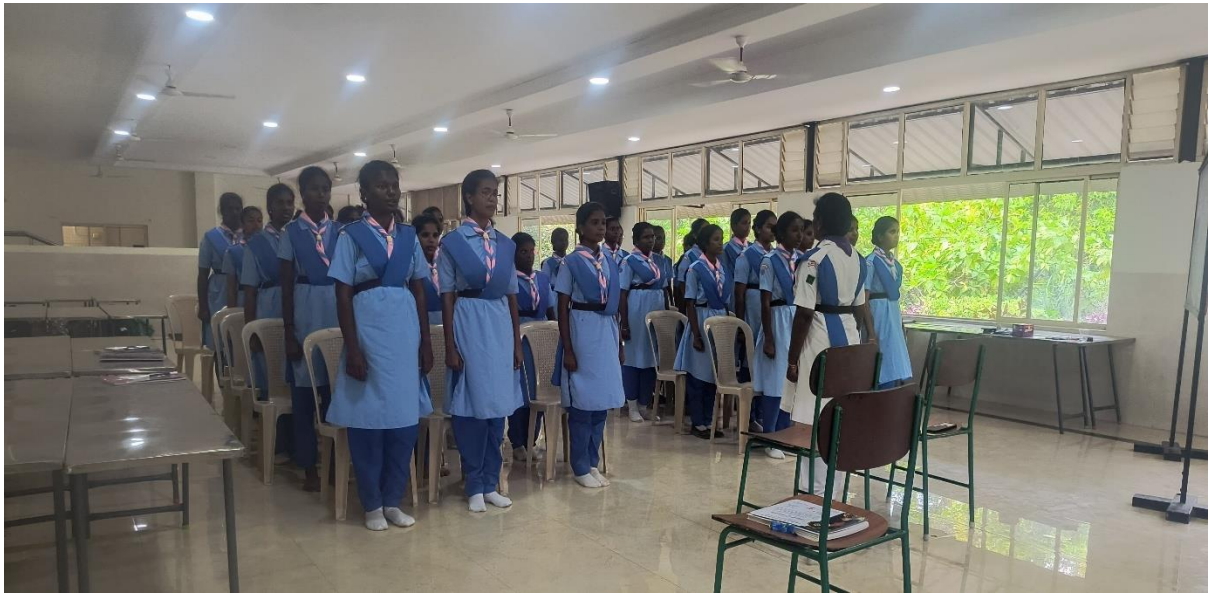
Celebration of 100 Years of World Thinking Day 21.02.2026