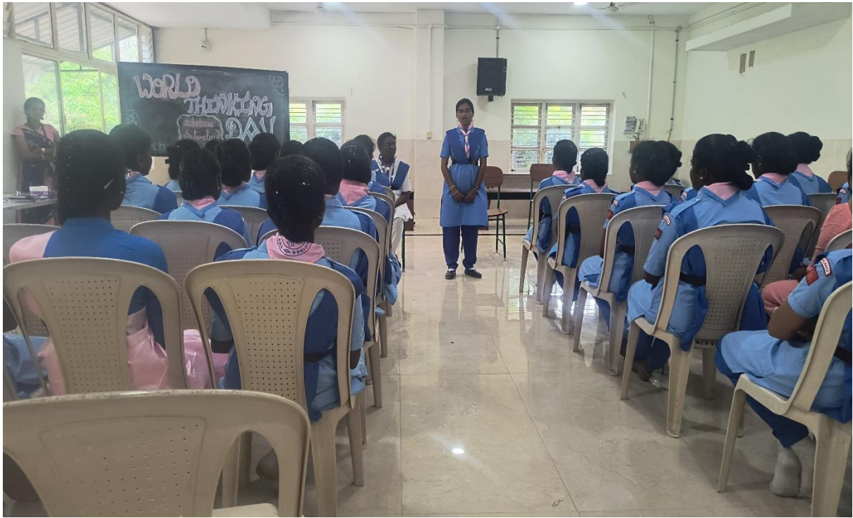
Celebration of 100 Years of World Thinking Day Speech on the Theme "Our Friendship" 21.02.2026