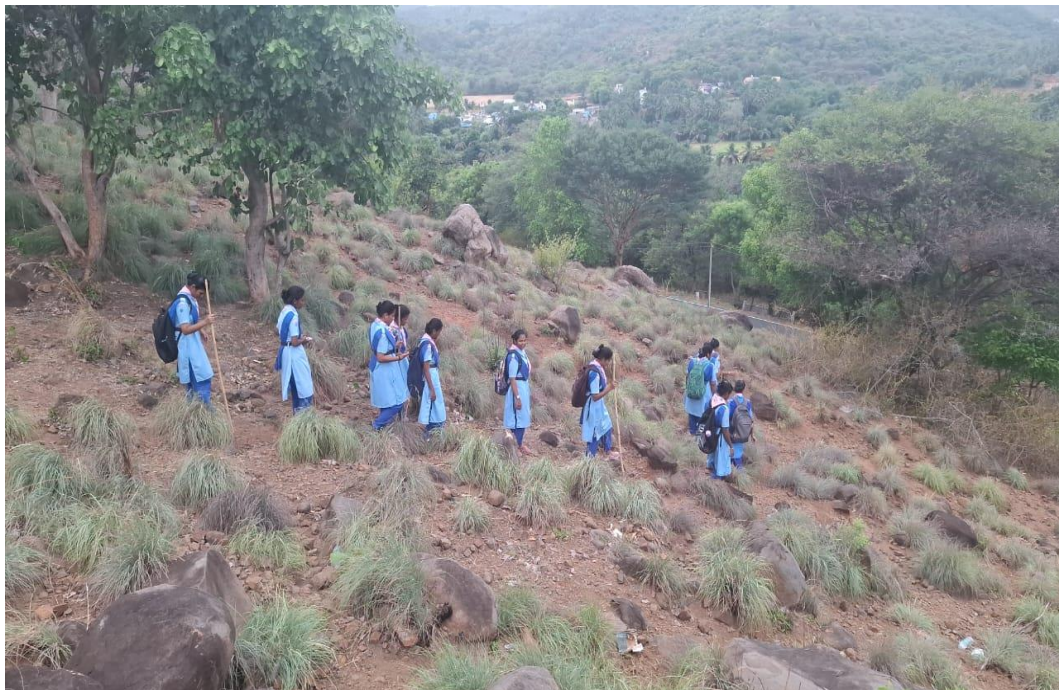
15 km trekking expedition from Sathuvachari Hills to Palamathi Hills on 5th July 2025