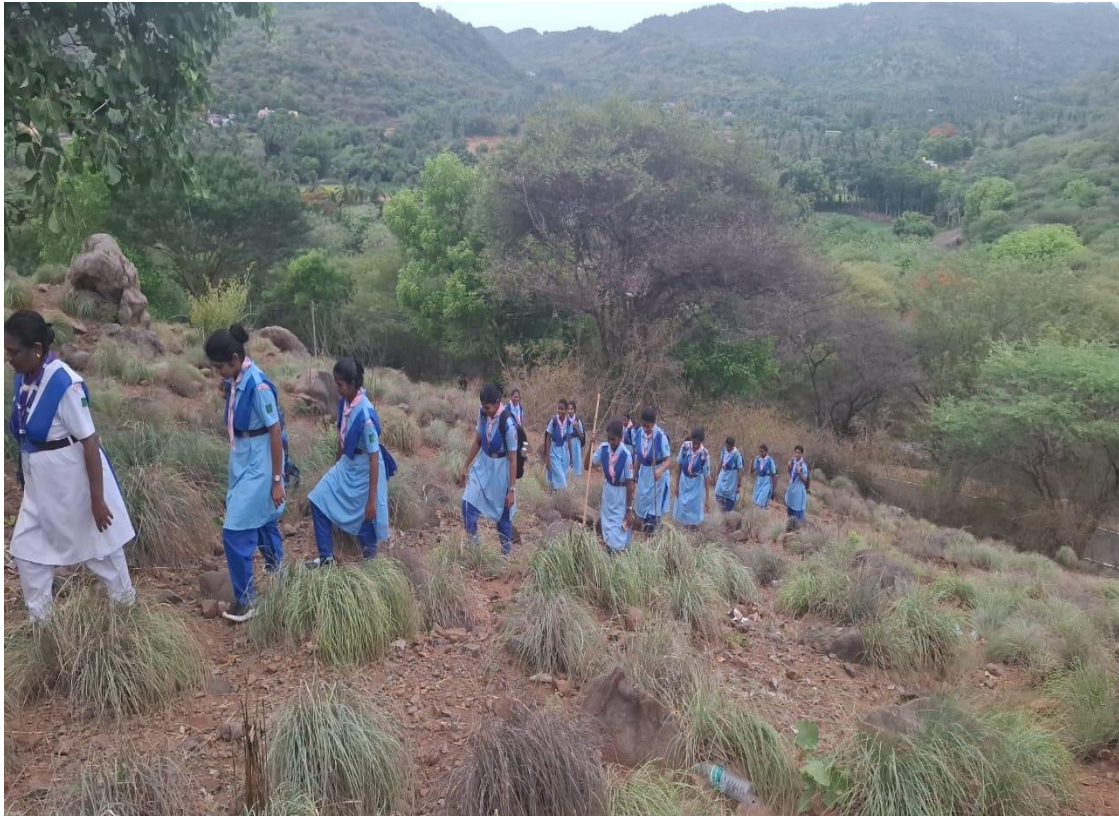
15 km trekking expedition from Sathuvachari Hills to Palamathi Hills on 5th July 2025